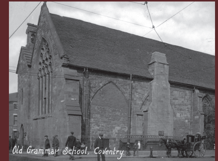
Old Grammar School, Coventry