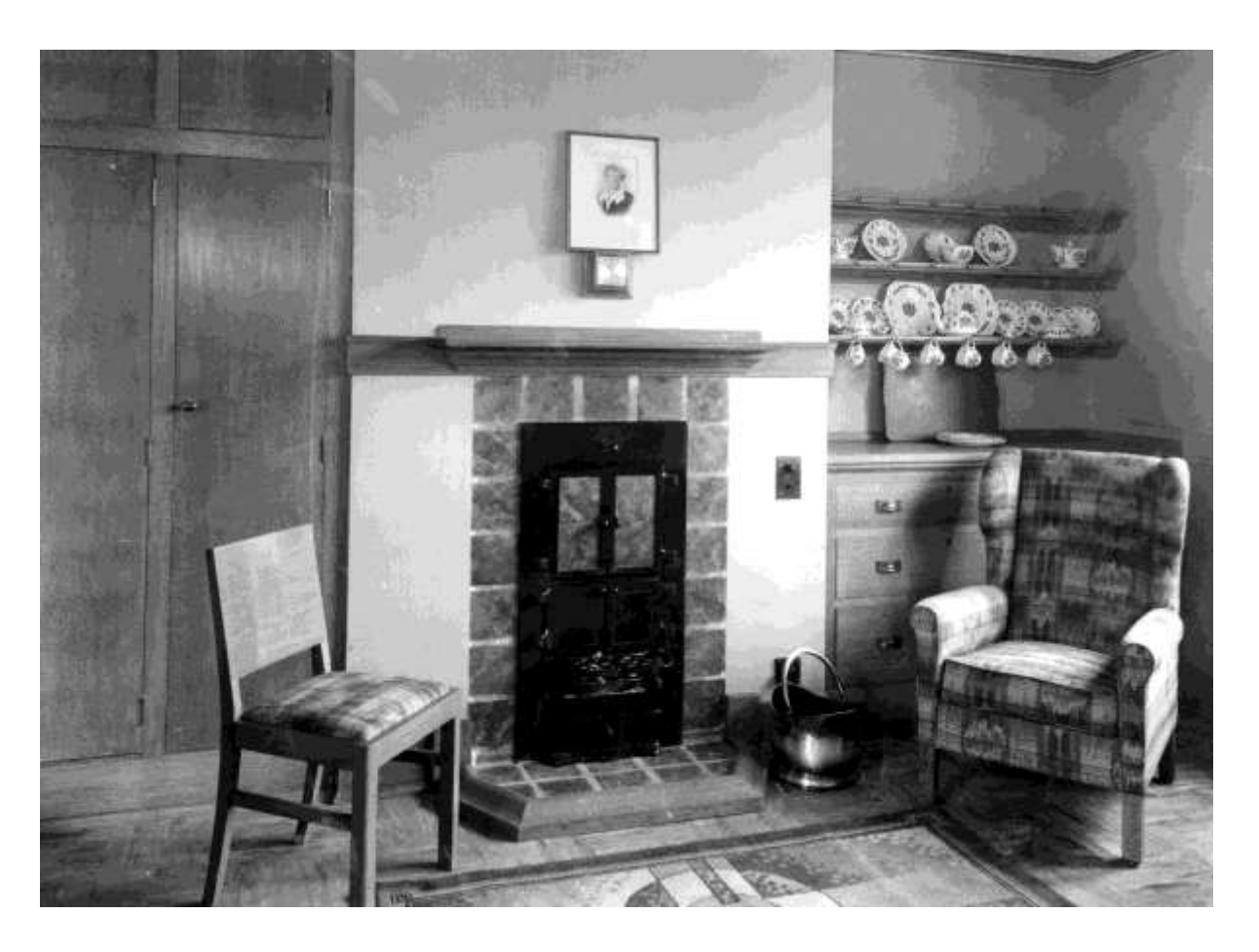
Lady Herbert's Almshouse, interior, 1936

Coventry Archives is located in the Herbert Art Gallery and Museum, Jordan Well, Coventry, CV1 5QP. Admission to both the Reading Room and Research Room is free. Documents and books can be consulted without charge, but a charge is made for photocopying or the taking of digital images.