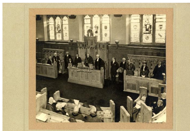
A picture of the then Duke of York (later became King George VI) at the grand opening of the Council House.

The Council House's design is reminiscent of Tudor style architecture and so it would be easy to mistake this building as being of a medieval construction. However, construction on the Council House began in 1913 and was not completed until 1917. The building was not officially opened until 11 th June 1920 by the Duke of York. The 7-year duration that it took for the Council House to open its doors is the result of disruption caused by WW1. The major war limited the efficiency of the process by compromising how many builders could work on the project as the war required many men to enlist. Similarly, some of the key developers working on the project had to apply for an exemption from military service. Delays such as these coupled up to make the grand opening of the council a very long and drawn out process.